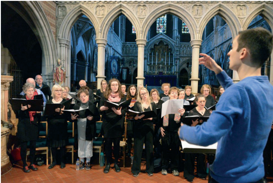
In rehearsal, St Augustine's Kilburn, March 2019

A chorus of angels will greet you, and with Lazarus, once a beggar, may you have eternal rest.